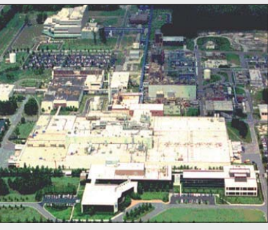
Figure 2: Catalytica, 1997 - Acquires Glaxo's Largest U.S. Manufacturing Plant

Some years ago when was Chairman of Catalytica, Inc., we had a strategy that for several years was targeted at hitting several "home runs." For example, we were developing with PetroCanada and Mitsubishi, a process that would in a single process step inexpensively convert natural gas to a liquid fuel that could be easily shipped anywhere in the world, doing away with the need for expensive liquefied natural gas (LNG) transport,