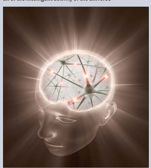
Figure 1: Cosmic Cosmology maintains that the consciousness that gives rise to your thoughts is also responsible for all of the intelligent activity of the universe

some 100 trillion cells, a number greater than all of the stars in the Milky Way galaxy. Each cell is less than 1 micron in diameter and contains instructions within each strand of DNA in its nucleus that would fill one thousand 600-page books. Each cell performs 100,000 activities per second, and every cell constantly harmonizes with every other cell in your body. If it didn't, you would be ill, or in the worst case, dead. This is why a healthy human body can think thoughts, play piano, kill germs, remove toxins, and make a baby all at the same time. Meta-physicists refer to this non-local correlation and synchronicity as omniscience, omnipresence and omnipotence.