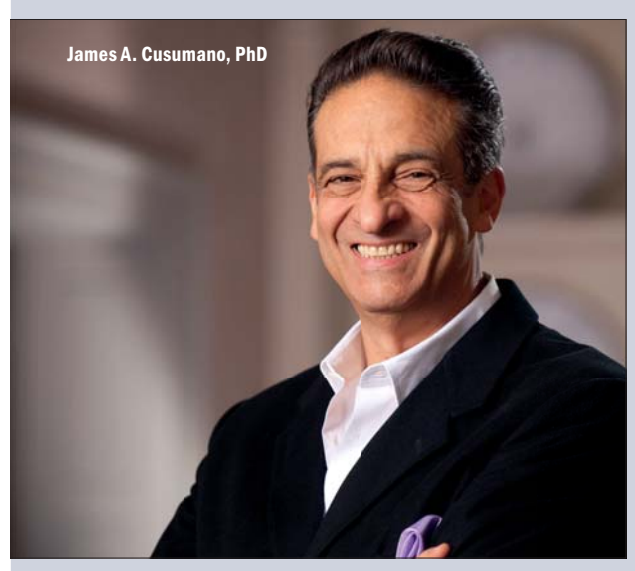
"The difference between fiction and reality? Fiction has to make sense."