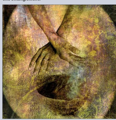
Figure 3: Because all energy-mass was intimately intact as a singularity before the "Big Bang," everything in the universe is Connected and synchronized. Physicists call this entanglement.

Consciousness that co-creates with your soul or Personal Consciousness, because your soul is an intimate part non-local Cosmic Consciousness.